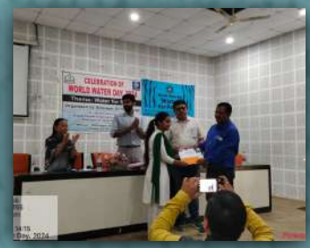
World Water Day Celebration