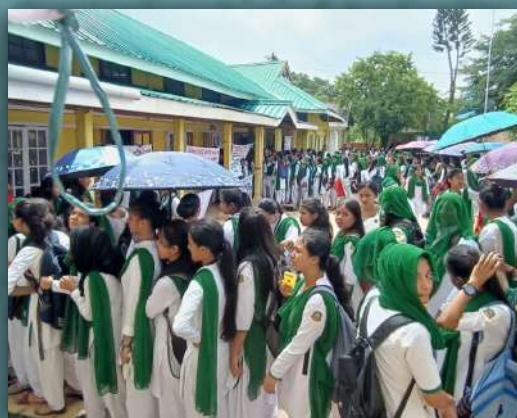
Student Union Election 2023