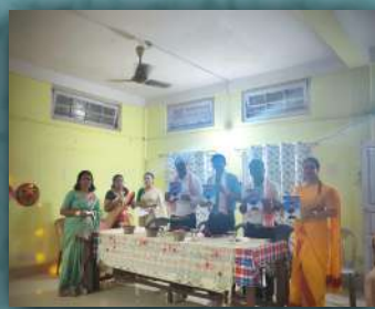
Inauguration of Hostel Magazine