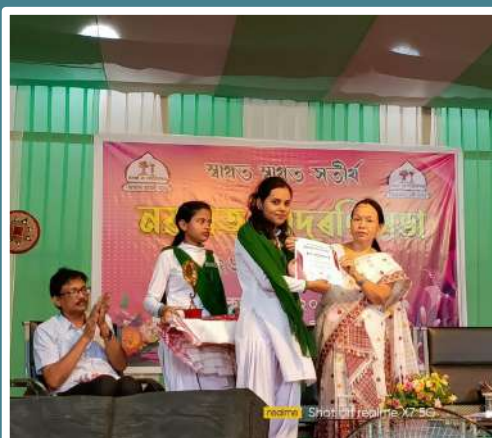
Best Library User Award 2022-23