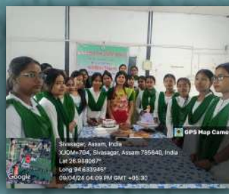
Cake Making Workshop