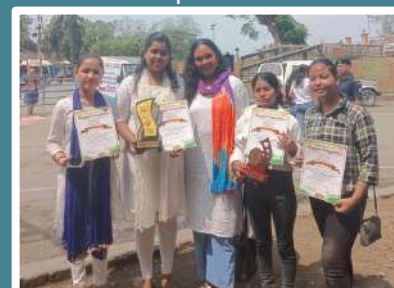
लोकसभा निर्वाचन उपलक्षे शिरसागर जिला डित्त आयोजन कर्वा आबुना प्रतिযোগितात प्रथम स्थान