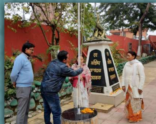
Republic Day 2023 Celebration