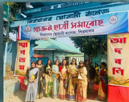
Alumnae Meet 2023