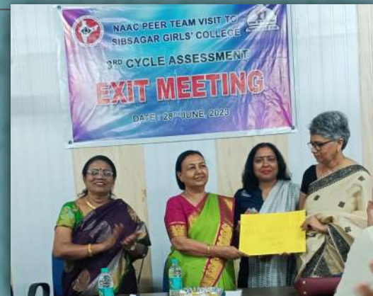
NAAC Peer Team Visit on June 2023