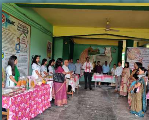
Prak Rangali Mela 2024