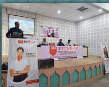
Career Counseling Programme