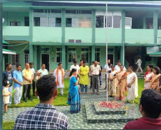
Independence Day 2023 Celebration