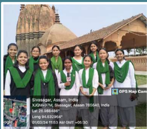
Participated in Voter Awareness Programme मेरा पेहला भोट देश के लिये. P.M. of India Highlighted our college group in his tweet.