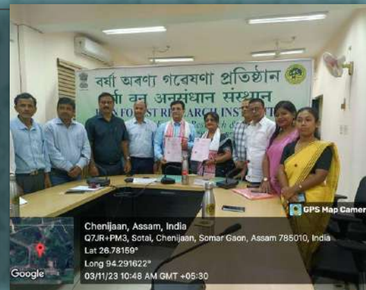
MOU with Rain Forest Research Institute, Jorhat