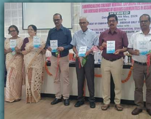
ICSSR Sponsored National Seminar