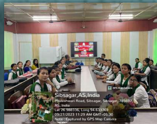
World Tourism Day 2023