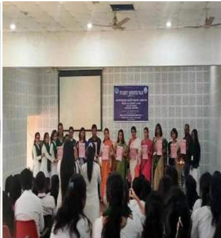
Release of the Newsletter