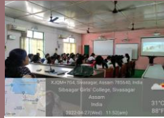
Organized " Film Watching Session" on 27 th April, 2022