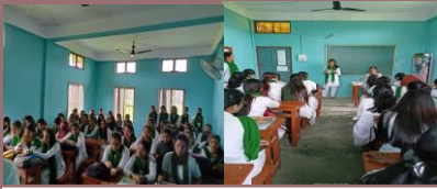
Observed Shakespeare Day on 23 rd April, 2022