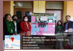
WON 3 RD prize in Wall Magazine 2021-2022