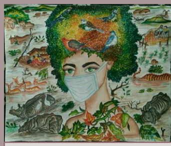
ART BY AYUSHMITA DIHINGIA, 2 ND SEMESTER