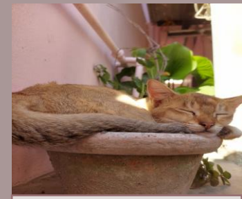
SNAP BY HIYA GOGOI, 2 ND SEMESTER

“I would always rather be happy than dignified.”