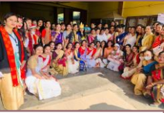
Department students during College Week