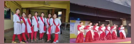
Department students won 3 rd Prize in Group Dance