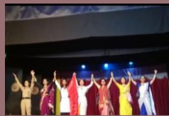
Department students won 2 nd Prize in Drama Competition