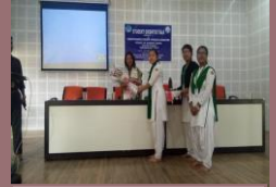
Student Oriented Talk on 10 th February, 2021