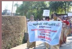
Cultural Rally during College Week