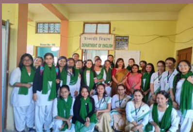
PREPARED BY 4 TH SEMESTER STUDENTS

A society for academic pursuits always plays a decisive role in moulding, facilitating and readying the involved group resulting in a creative gush. Such is the English Department Society. It shall continue to deliver the fresh nuances to the taught.